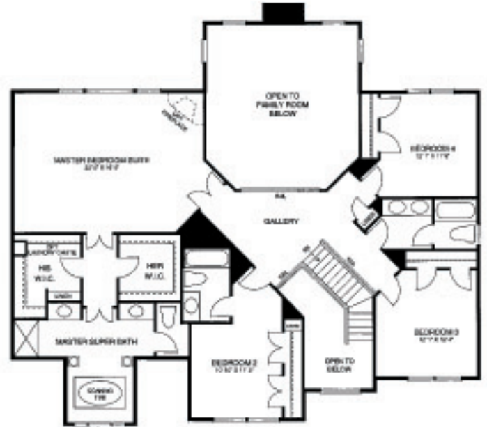
ALTERNATIVE SECOND FLOOR PLAN